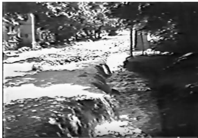
Figure 7 – Ground failures at Memory Grove entrance during 1983 flood about 600 feet from the proposed Well looking north. SLC Fire Tech. 1984. Salt Lake City Flood of 1983. Video. At min. 5:44. (url: https://youtu.be/WCU_AymQ6J0?t=344 ).