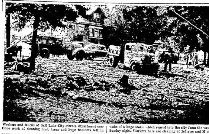
Figure 3 - M Street and 1st Avenue after 1954 Perry's Hollow Flood. Salt Lake Telegram, August 20, 1945. The house in the background still exists.

Craddock described causes of the Perry's Hollow flood, citing a historical pattern of overgrazing, grass fires and cloudburst rain: