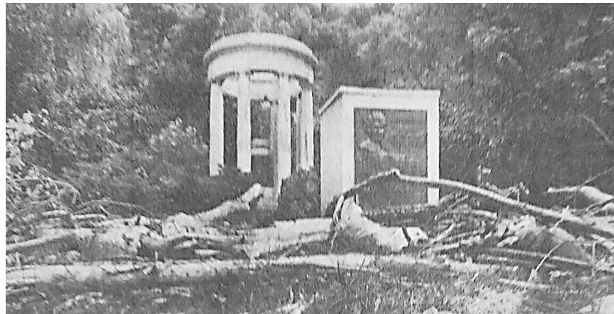
Figure 4 – Tree debris in Memory Grove Park after flood waters receded. Salt Lake City Tribune, July 22, 1983. “Restoration of Memory Grove will be a joint project.”

Catastrophic high-spring run-off again occurred in 1983 with ground failures near the proposed Well site. On May 26th, 1983, City officials proclaimed a flood emergency in Salt Lake City after a winter of heavy snowfall followed by a late season warming. 18 The city pre-ordered 250,000 sandbags ( id ). Sandbagging State Street kept City Creek from flooding underground parking at ZCMI Mall ( id ). On May 28th, 1983, Mayor Ted Wilson learned that rock and tree debris from City Creek Canyon were clogging up the 1910 underground culvert down State Street and a second pipe system along North Temple ( id ). The flood waters swept fallen trees that had accumulated in the 12 miles of City Creek stream bed above Memory Grove Park and down into the lower canyon, about 600 feet north of the proposed Well site (Figure 4).