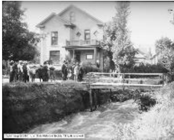
Figure 1 - Shipler Commercial Photography. June 2, 1909. Flood at 4th (Fourth) Avenue and Canyon Road. (url: https://collections.lib.utah.edu/ark:/87278/s69c7802 ). The home shown in the photograph is still standing at approximately 220 North Canyon Road.

In 1910 and in response to this flooding, the City and DPU's predecessor began construction to capture the City Creek stream upstream of the proposed Well into an underground conduit 6 with a design capacity of 120 cubic feet per second squared.