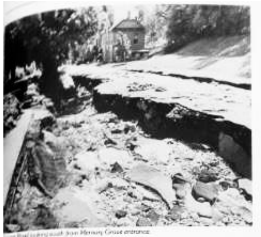
Figure 6 – Twelve Foot Deep Surface Failure North of Ottinger Hall and 400 feet north of proposed Well site, looking south, June 9, 1983. Salt Tribune. 1983. Spirit of Survival: Utah Floods of 1983.