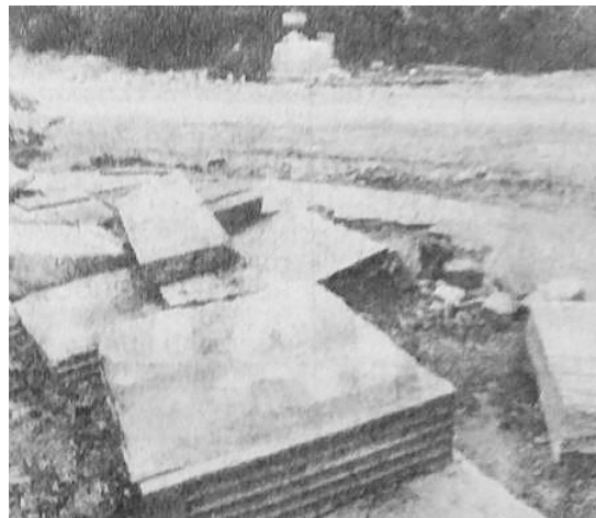
Figure 9 – Stone blocks in columns moved by water flows. Salt Lake City Tribune, July 22, 1983.

The force of the 1983 waters at a peak of 331 cubic feet per second, the waters had sufficient force to topple stone columns in Memory Grove.