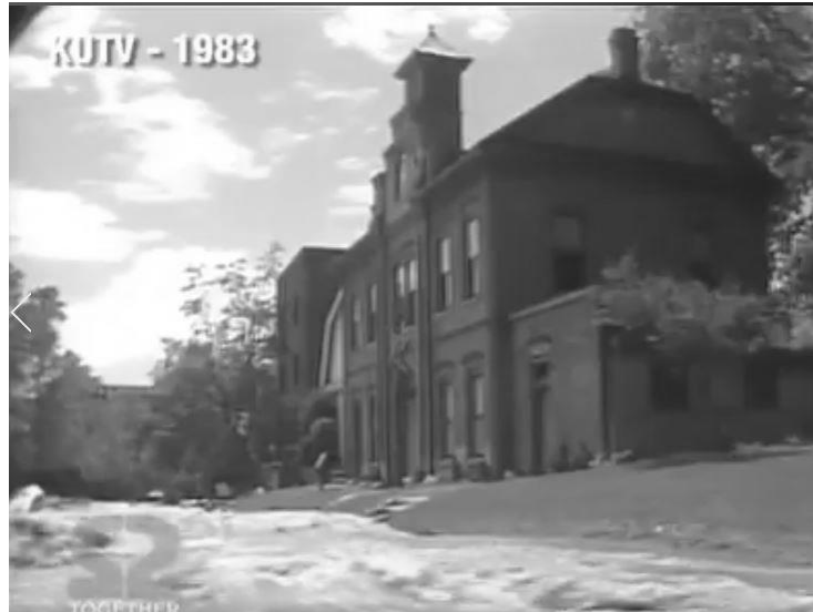
Figure 5 – Flood waters passing Ottinger Hall 300 feet north of proposed Well in June 1983.

Nevertheless, flood waters were so great that the creek also flooded above its entry point