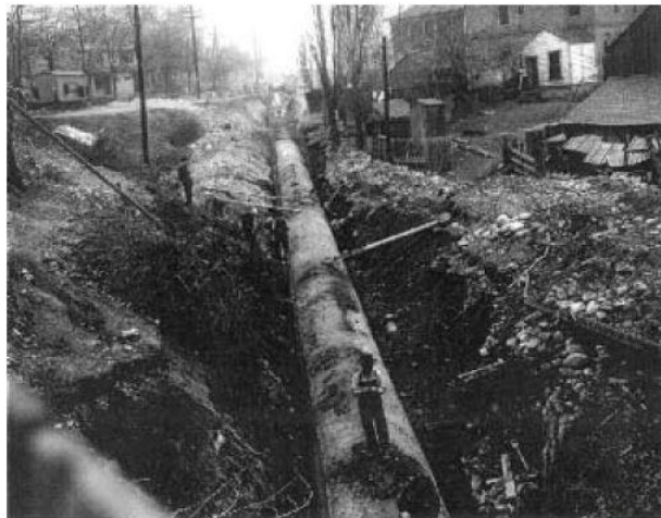
Figure 2 – Entombment of City Creek Canyon Stream circa 1909. U.S. Army Corp. of Engineers. From Love, ftn 22 infra .

In 1910 and in response to this flooding, the City and DPU's predecessor began construction to capture the City Creek stream upstream of the proposed Well into an underground conduit 6 with a design capacity of 120 cubic feet per second squared.