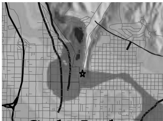
Figure 2 – Excerpt - Ground Shaking Map from Wong 2002. Notes: The proposed DPU facility is marked with a star in an MMI IX predicted shaking region. The faults to the immediate west are extensions of the Warm Springs Fault and have been active in the last 15, 000 years.

earthquake, the ground in Memory Grove will move horizontally between 0.3 and 1.0 meters. Horizontal accelerations will be between 0.9 and 1.0 standard gravities ( g_n ). During such an earthquake event, there will be an estimated 2,000 to 2,500 deaths, and the estimated number of injured persons needing hospital care is between 7,400 and 9,300. 9