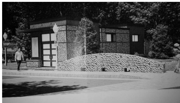
Figure 1 - Excerpt from DPU Architectural Rendering showing daytime view from south east. May 9, 2019.

(ii) the access to the pump station shall be six inches above the surrounding ground and the station located at an elevation which is a minimum of three feet above the 100-year flood elevation, or three feet above the highest recorded flood elevation, which ever is higher , or protected to such elevations . . . (emphasis added).