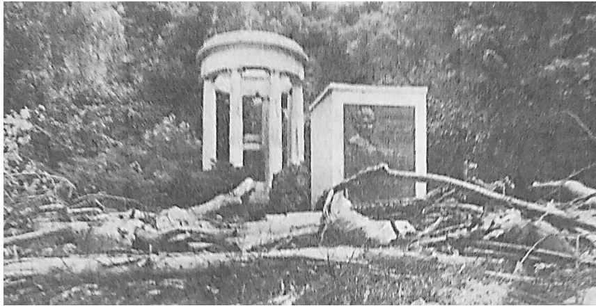
Figure 3 – Tree debris in Memory Grove Park after flood waters receded. Salt Lake City Tribune, July 22, 1983. “Restoration of Memory Grove will be a joint project.”

Part of the damage in the City's 1983 flood was caused by administrative policies. Since the late 1800s, the City had a program of removing fallen trees from the City Creek Canyon streambed from Pleasant Valley 16 to Memory Grove, but this was discontinued during the 1910s. Currently, the DPU only removes trees that have fallen on or endanger traffic along City Creek Canyon Road; there is no systematic program to remove fallen trees from the stream bed. The 1983 high-snow pack flood waters swept fallen trees that had accumulated in the 12 miles of City Creek stream bed above Memory Grove Park and down into the lower canyon, about 600 feet north of the proposed Well site: