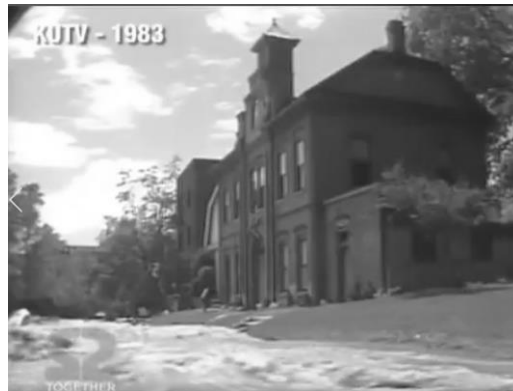
Figure 2 – Flood waters passing Ottinger Hall 300 feet north of proposed Well in June 1983.

The proposed 4 th Avenue and North Canyon Road site in the geologic stream bed also has been repeatedly flooded by the high-snow pack runoff waters of City Creek Canyon. 10 As a result of the 1983 state-wide floods from high-snowpack melting, the DPU's predecessor spent about $1,000,000 repairing flood damage to roads from North Temple and State Street north to Memory Grove. 11 The City replaced 1,040 feet of 6" inch pipeline excavated and damaged by flood waters between 4 th Avenue and Memory Grove, 18 subsurface sewer and water connections in the area were destroyed, and the foundations of the old Brick Tank house north of Memory Grove were undermined ( id ).